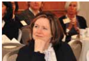
Illustrations: Rafael Edwards